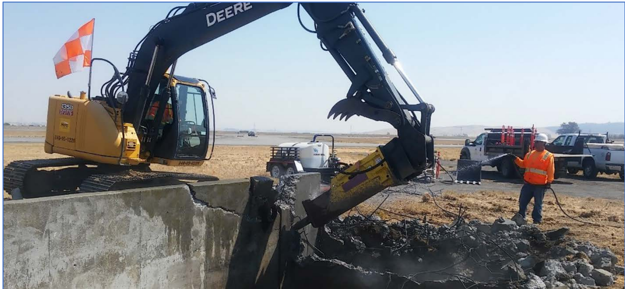
Oil/Water Separator Decommissioning: Heavy equipment operators tear down the walls of an unused oil/water separator. The concrete rubble was transported off-base for recycling, and restoration of the site reduced mitigation costs by creating additional California Tiger Salamander habitat acreage.

fieldwork also removed two airfield obstructions that posed potential aircraft safety issues. Completion reports and supporting documents are underway to close one quarter of the Travis AFB ERP in 2017. Additionally, clean stockpiled soil from the previously mentioned technology demonstration project was used as fill to restore the oil/water separator sites, which saved approximately $20,000.